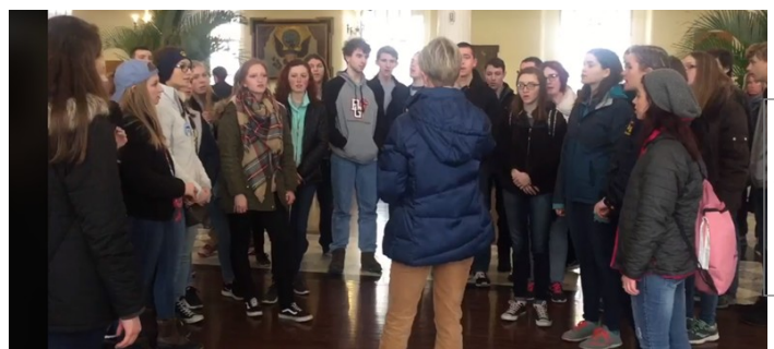
The group visited St. Paul Chapel.